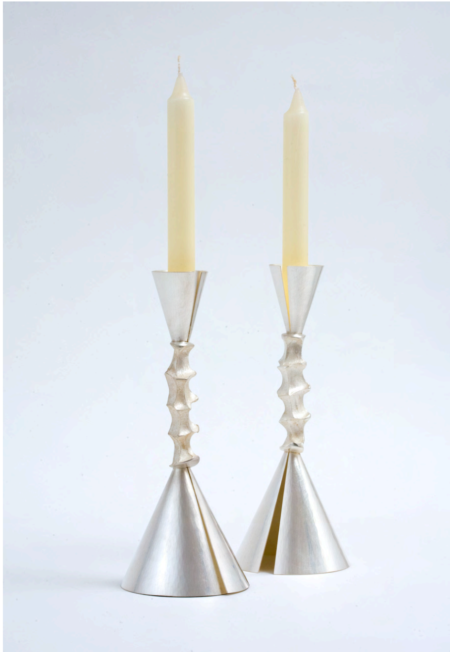
Männlich / Weiblich, candelholders, 2010, silver, 5.75" / 14.5cm height

silver with imprints from within the artist's grip, the forms resemble spines at first glimpse.