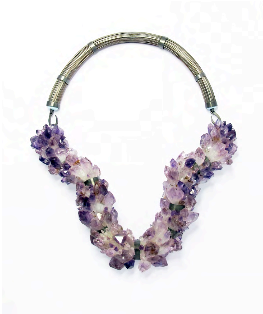
Amethyst Arrangement , 2015 necklace, amethyst, wood, silver, paint