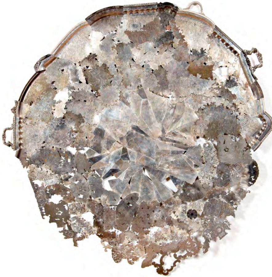
Platter / Tatter , 2015 found silver plated platters 59 x 57 x 3 inches