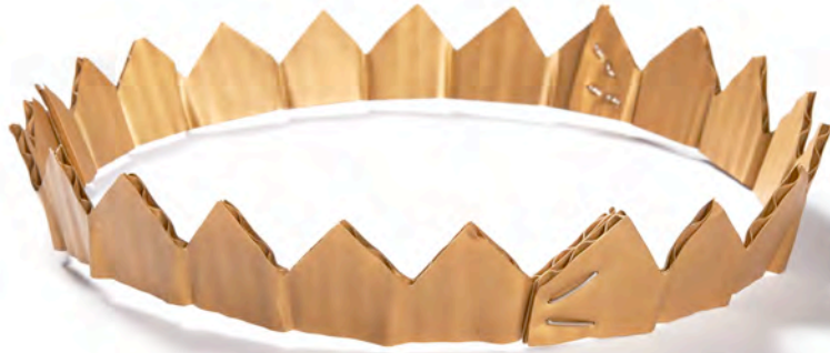
Cardboard Crown, necklace, 2015, 18k gold

Bielander hides nobility in plain sight, laboriously creating by hand, a wearable piece with substantial material value disguised as the creations of a child first discovering scissors and stapler.