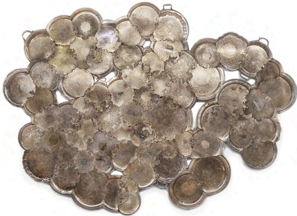
Platter / Gather, 2016 found silver plated platters, 96 x 72 x 3 inches