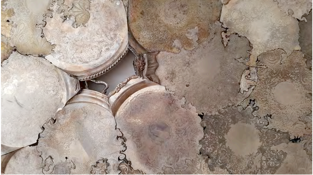
Platter / Gather, 2016 (detail)