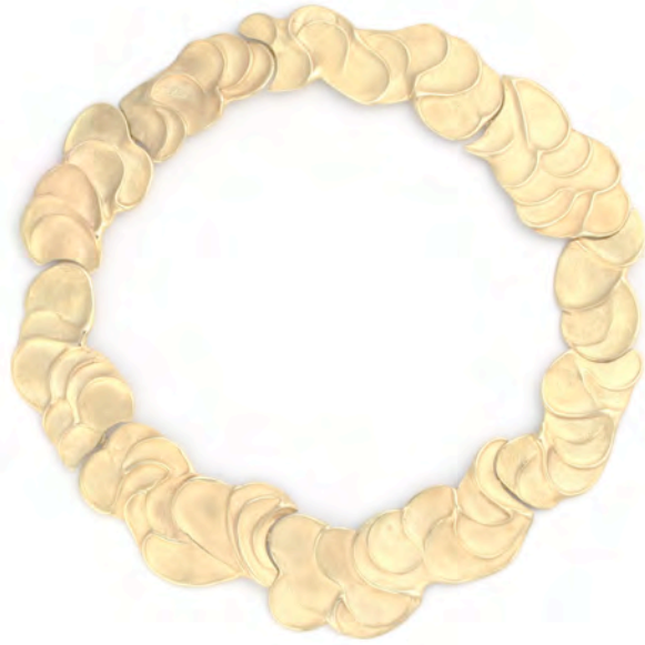
Der Vorgang des Formens in Wachs, 1988, 18k gold