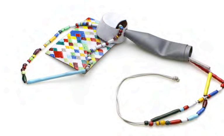
Squished Tanky , 2017, necklace, enamel, copper, silver, nickel, cord, 4.9 x 2.75 x 2"

wearables reference the toys and symbols of his Military Brat childhood.