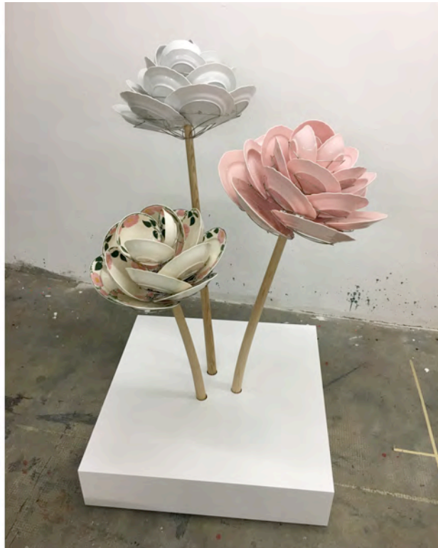
3 Roses, 2017, steel, porcelain tableware, wood, 36 x 36 x 63"

Awarded the Grand Prix Suisse Design Prize during the Basel Switzerland Design fair last June, Bielander stuns again with a new Rose sculpture, created specifically for the fair. Each flower is a hand-made rack containing a useable dinner set. The stems grow gracefully from the base as if swaying in a light summer breeze.