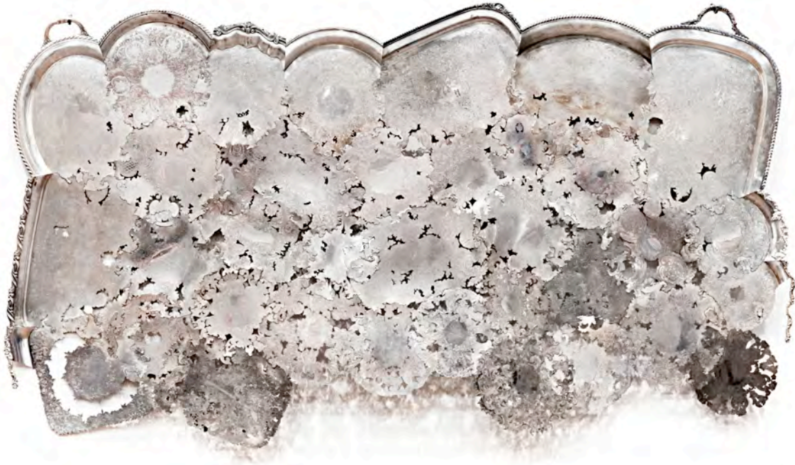
Platter / Rather, 2016 found silver-plated platters, 45 x 76 x 2"