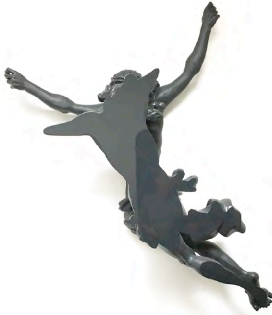
Corpus Manus, 2017 Hand-carved lime wood, auto lacquer, 44 x 31.5 x 7.9"