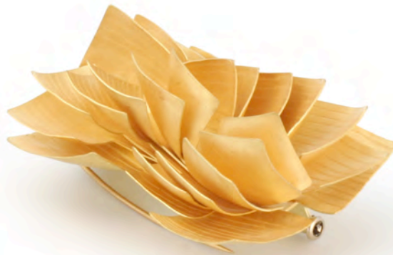
Half Spiral, 2016, brooch, 18k gold, 1.8 x 1.25 x .75"

Meticulous handcraft combined with delicate sensitivity makes the wearable goldwork of Jacqueline Ryan unforgettable.